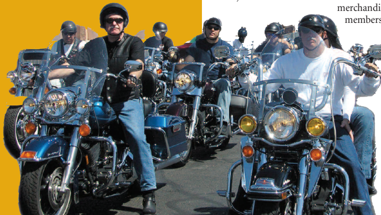
Inaugural Ride, August 2005, Las Vegas, Nevada

Additionally, 16 members (one from each of the districts represented by the IAFF) are appointed by the General President to serve as district event coordinators responsible for events and activities in their districts. Additionally, state/provincial coordinators have been appointed to assist the district event coordinators with support events and activities within their respective state or province.